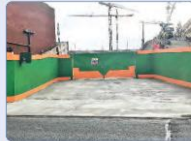
▲ NEW MOUNT BROWNE ENTRANCE/EXIT

More information on the new entrance/exit at can be found on the back page of this newsletter.