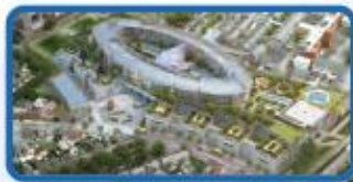
▼ AERIAL ILLUSTRATION OF THE NEW CHILDREN'S HOSPITAL, ST. JAMES'S CAMPUS