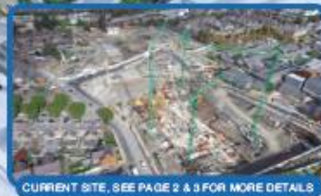
CURRENT SITE, SEE PAGE 2 & 3 FOR MORE DETAILS